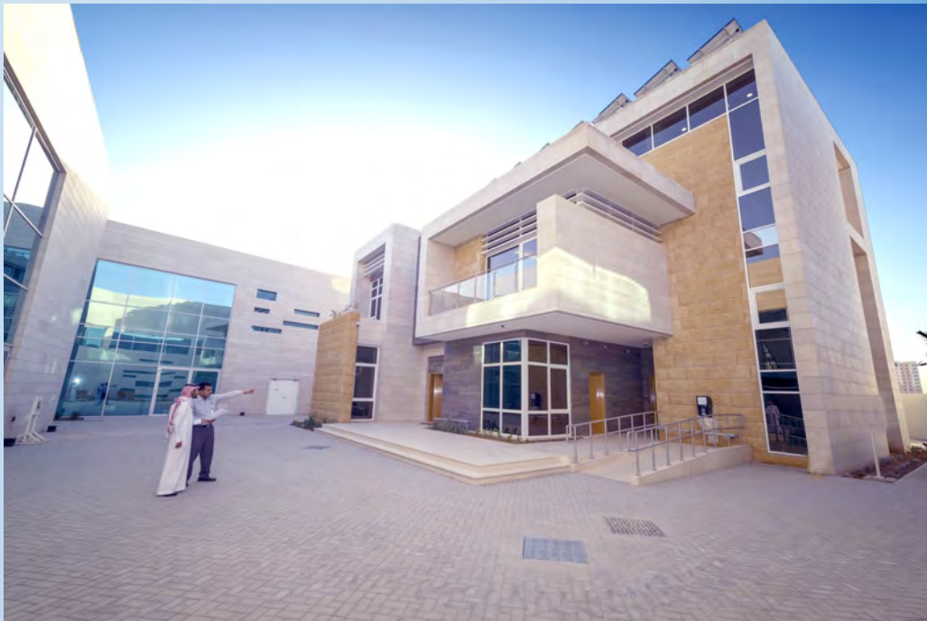
SABIC Home of Innovation, Riyadh