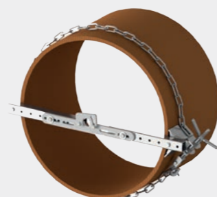
VE.20600 Hook on Kit