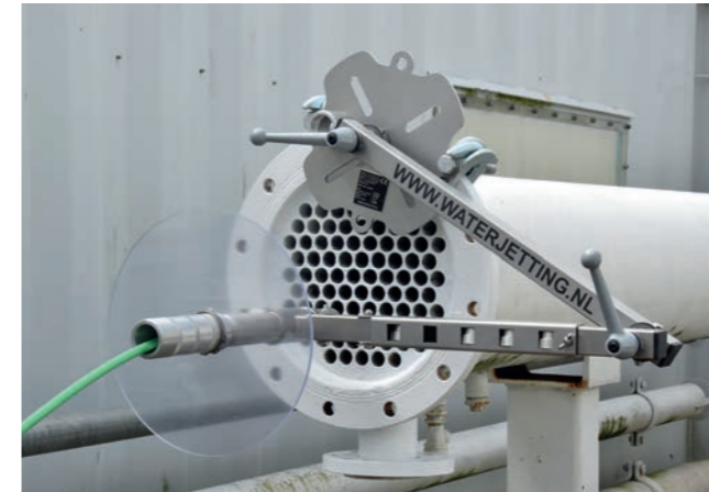
HOSE CATCHER VE.70500