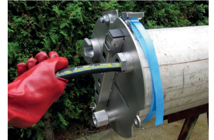
HOSE CATCHER VE.80000