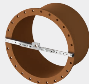
VE.20500 Extension Kit

The easy to connect Hook on Kit makes it possible to strap the Hose Catcher VE.20000 onto non-flanged pipe lines.