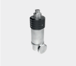
Aquamat S The smallest of our Aquamat tank cleaning units impresses with its patented HPS technology, which is also used in our Masterjet rotor jets.