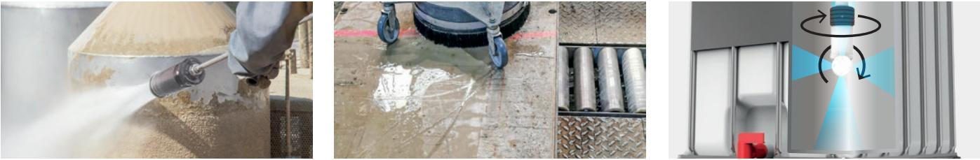
General gun blasting work Surface cleaning Vessel cleaning Industrial cleaning Cleaning of shuttering and scaffolding Cleaning of vehicles and construction machines Cleaning plaster molds and matrices