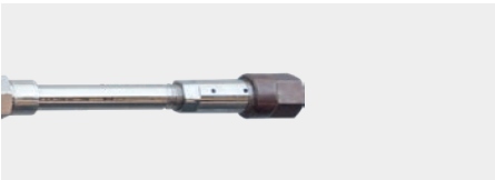
Fan jet nozzle (15°)