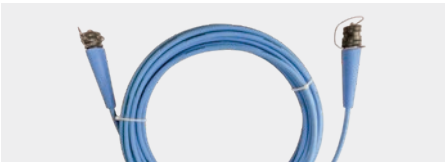
Control cable (25 m)