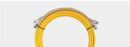
High-pressure hose (20 m)