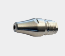
RD Mono (up to 2000 bar) The simple rotor nozzle treats surfaces with high precision precisely and reliability at an operating pressure of up to 2000 bar.