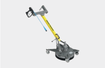
Aquablast Basic E Made for high class surface treatment, the electrically controlled Aquablast Basic E is a useful addition to a professional set-up that extends the possible range of applications with the HDP 30 Basic.