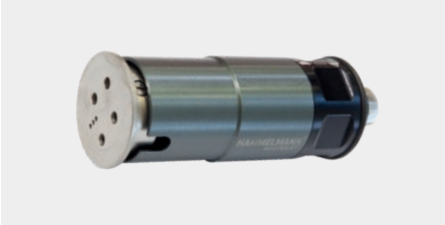
RD Masterjet (up to 3200 bar) The water tool for pros. Thanks to its compact and leight-weight design, enduring, fatigue-free work is possible. The Masterjet ensures a long service life thanks to the use of the patented HPS sealing system and robust components.