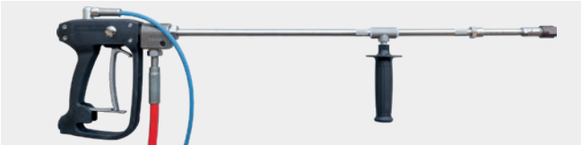
High-pressure spray gun SP 3000 E with electrical connector Hammelmann high-pressure spray guns are designed for demanding, industrial use. The ergonomically shaped handle and various extensions are easy to install.