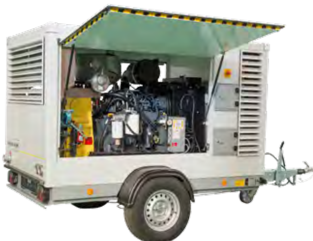
Road going single axle trailer-mounted MultiJet series with noise-reducing hood. Up to 70 kW power.