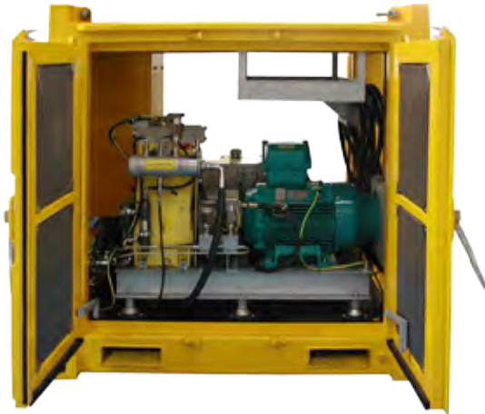
Containerised – electric and diesel units can be mounted in industrial or offshore certified containers.

The following machines can all be used to provide the high pressure water for our internal and external bundle cleaning equipment. Additionally, these machines can be used with hand-held lances, and a range of surface and floor-cleaning equipment.