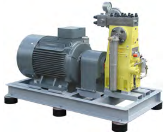
Skid-mounted - lightweight, versatile, electric or diesel options. Suitable for permanent site location.