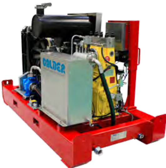
Skid-mounted diesel unit - rugged design with trailer-mounted option.