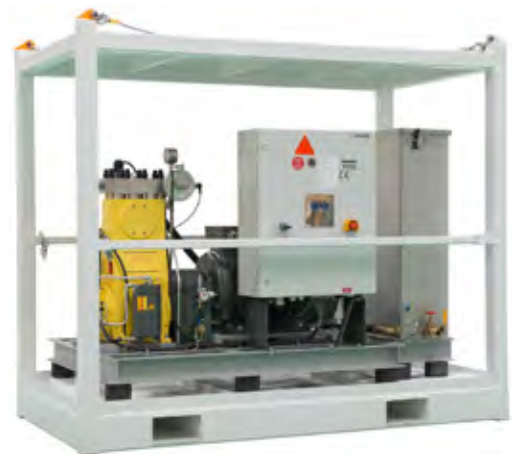
Crash Frame - offers protection during transportation, whilst giving easy access for maintenance. Suitable for onshore or offshore applications.