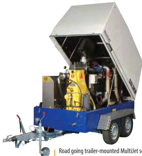
Road going trailer-mounted MultiJet series with noise-reducing hood. Over 120 kW power.