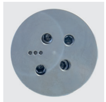
Steel protective cap for wear prevention