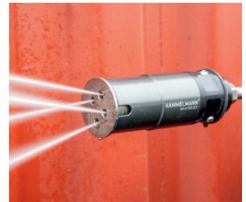
Number of nozzles: 4

Length: 170 mm Diameter: Ø 56 mm Weight 1 kg*