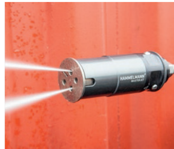
Number of nozzles: 2