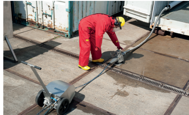
DERC ROTOCAR, EASY OPERATION