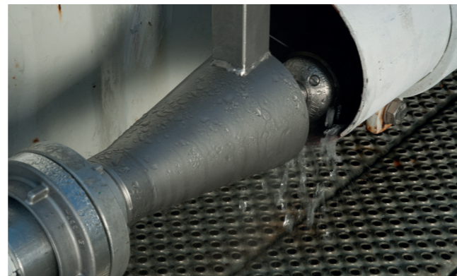
DERC ROTOCAR HOSE GUIDE