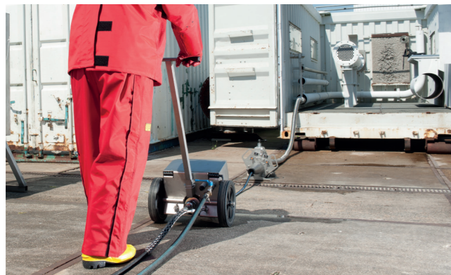
DERC ROTOCAR, ALWAYS AT A SAFE DISTANCE