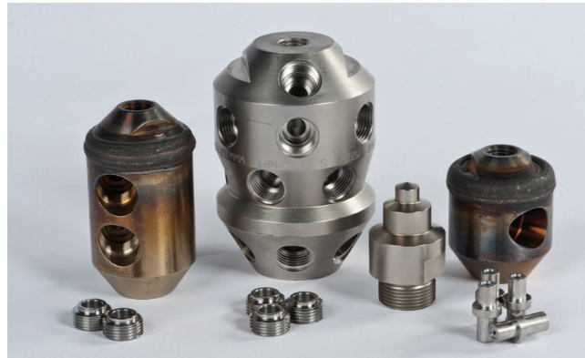
DERC ROTOCAR NOZZLES & ACCESSORIES